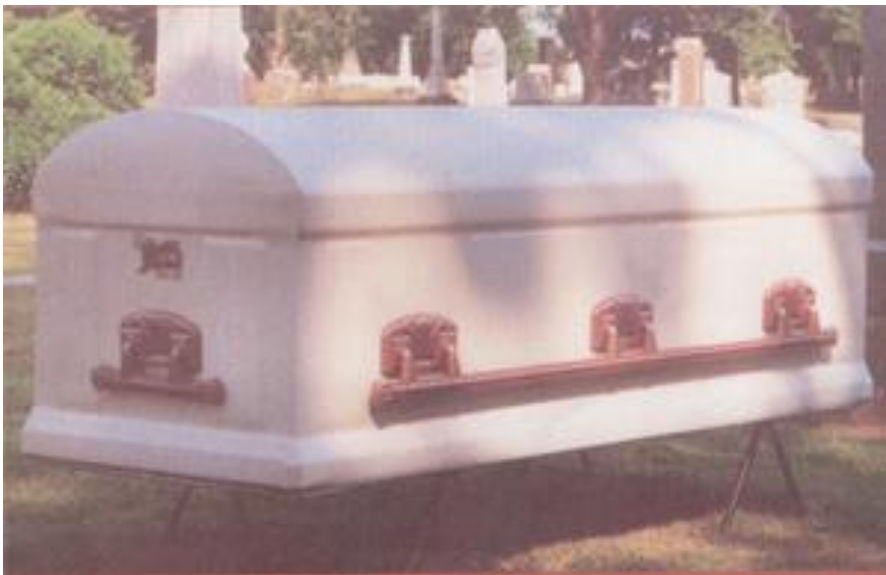
12 GA Regular Steel Vault