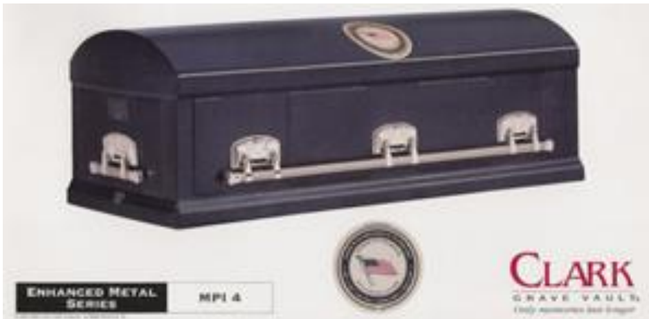
American Valor Vault