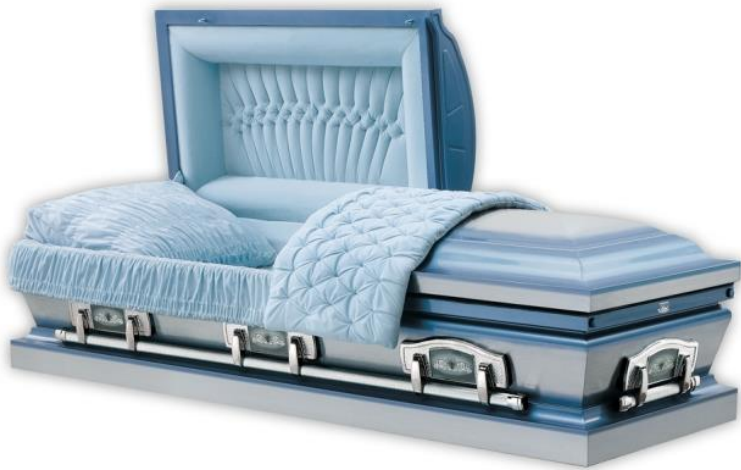
Morgan Mystic Blue