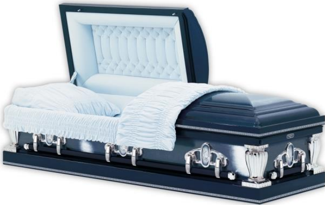
Augustine Metallic Blue