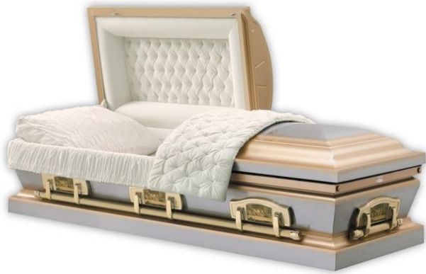
Vanderbilt Golden Fawn