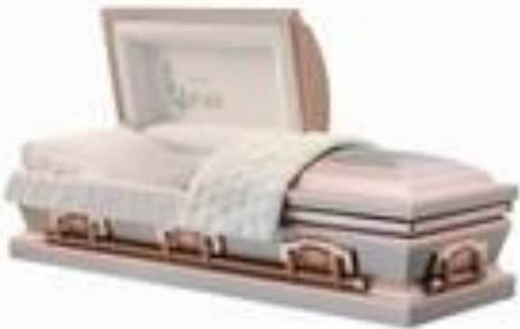
Mothers Champagne Rose