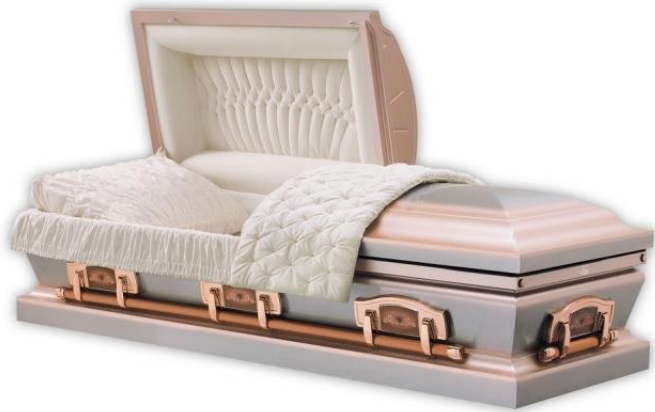
Morgan Champagne Rose