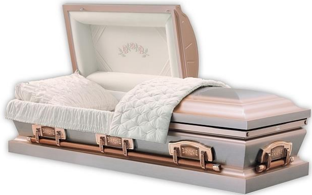
Eleanor Champagne Rose

Consumer may choose from the following caskets, includes 12 Gauge Galvanized Steel Vault