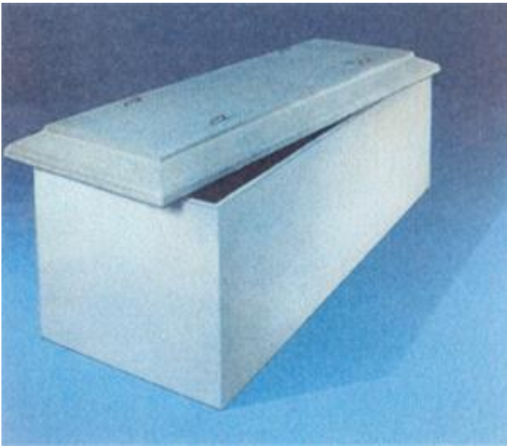
Cement Rough Box