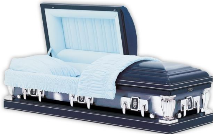
Phoenix Metallic Blue