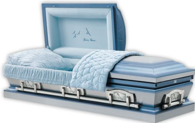
Carnegie Mystic Blue